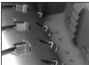
Large diameter rotor with "Swing Style" ram and serrated front surface.