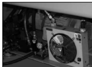
Two-stage hydraulics with air cooler for long life.